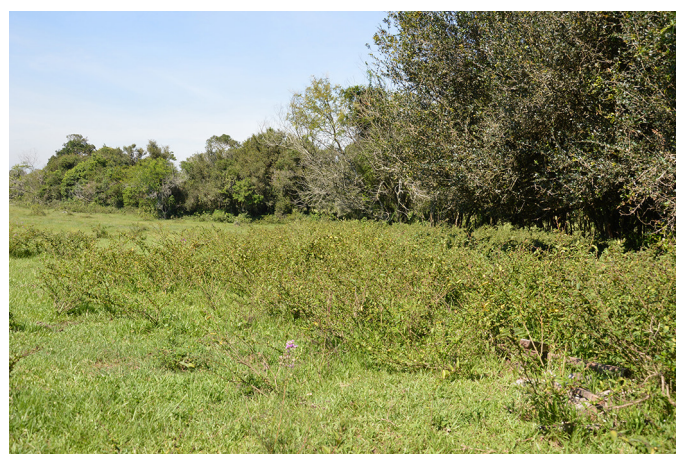
Fig.2. Spontaneous poisoning by Sida carpinifolia (Malvaceae) in horses. Horses affected by the condition were kept on a native pasture that was widely infested by Sida carpinifolia .