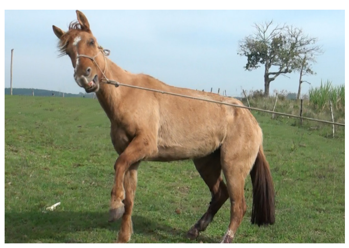
Fig.1. Spontaneous poisoning by Sida carpinifolia (Malvaceae) in horses. Horse with a poor body condition showing abnormal behaviour with exacerbated reactions after induced movement.

The outbreak occurred on a property located in Viamão, Rio Grande do Sul, with a total area of 60 ha. The production was focused on beef buffalos, and the herd was kept on native pasture without supplementation with a total of fifteen Crioulo horses. Five horses had a common history of neurological signs and progressive weight loss, including four ten-year-old adult horses and one foal. Four of these animals died over a clinical course of 90 days and one was euthanized and subject to necropsy. The clinical signs were characterized by progressive weight loss, incoordination, stiff gait, rambling, abnormal behaviour, exacerbated reactions (Fig.1) and locomotion difficulty after induced movement (hyperesthesia). Frequently, according to the property owner, these animals were found trapped in fences or in dense brush areas. When the native pasture was inspected. a wide infestation with Sida carpinifolia along the fences and riverside was observed (Fig.2). The buffalos did not show any similar clinical signs.